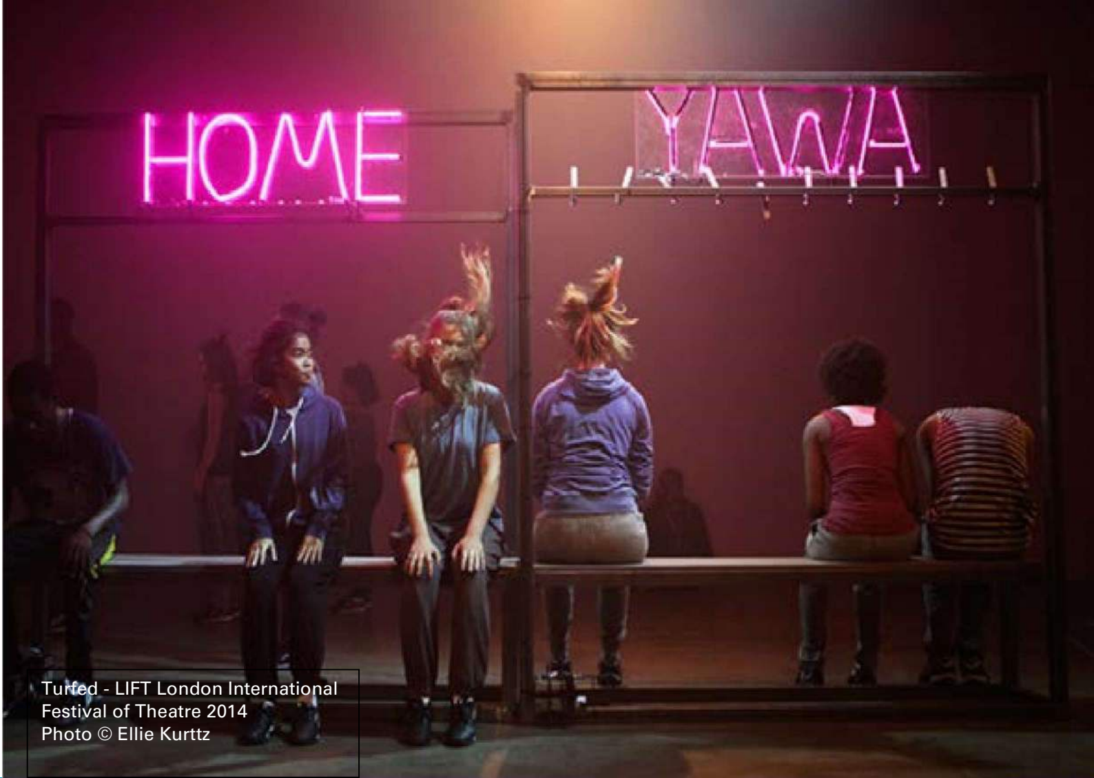
Tufted - LIFT London International Festival of Theatre 2014